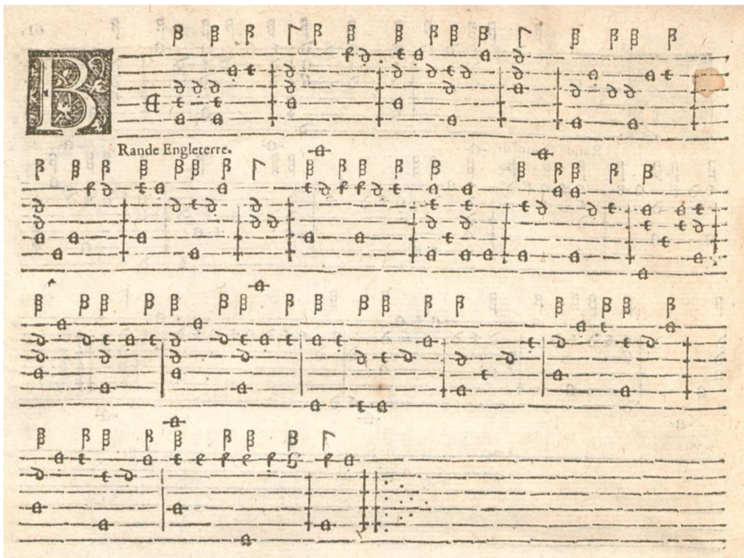
French lute tablature